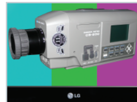
Minolta Chroma Meter Calibration Tool