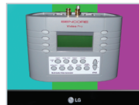
Sencore Video Generator Calibration Tool